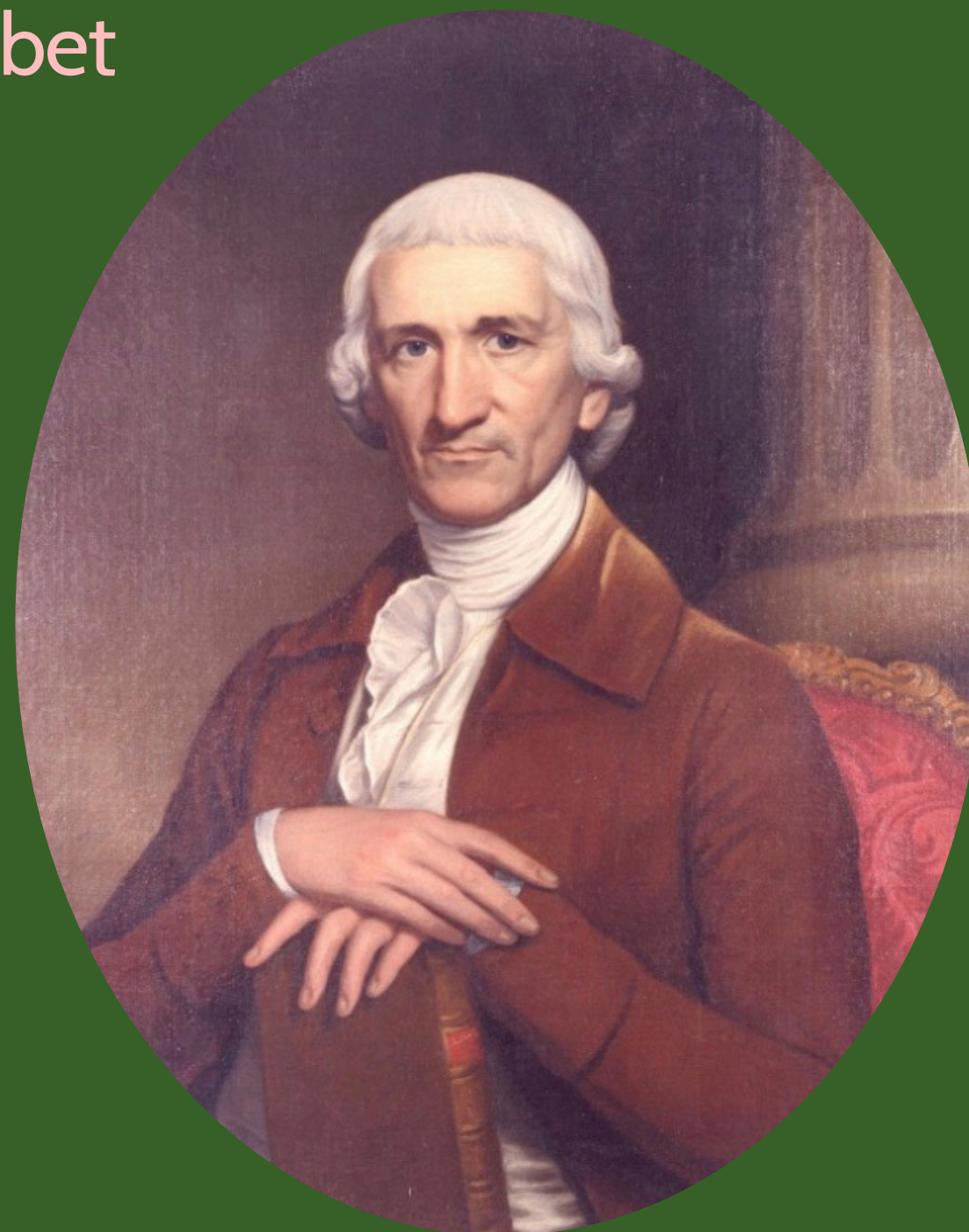
CHARLES THOMSON, SECRETARY TO THE CONTINENTAL CONGRESS