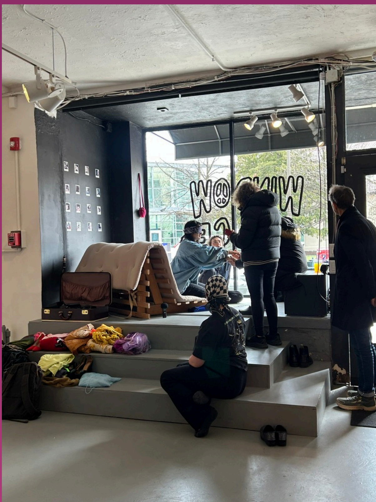
A picture of Window Peace: An Anarchive a feminist storefront performance project featuring a three-day durational program