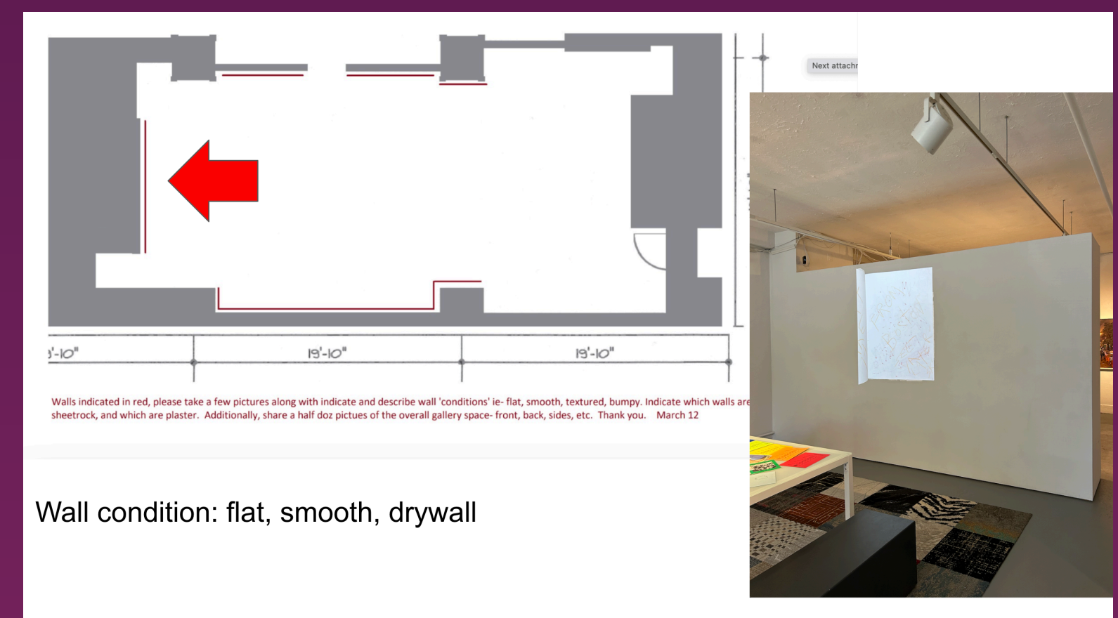
My wall conditions of the front gallery for Presidents installation