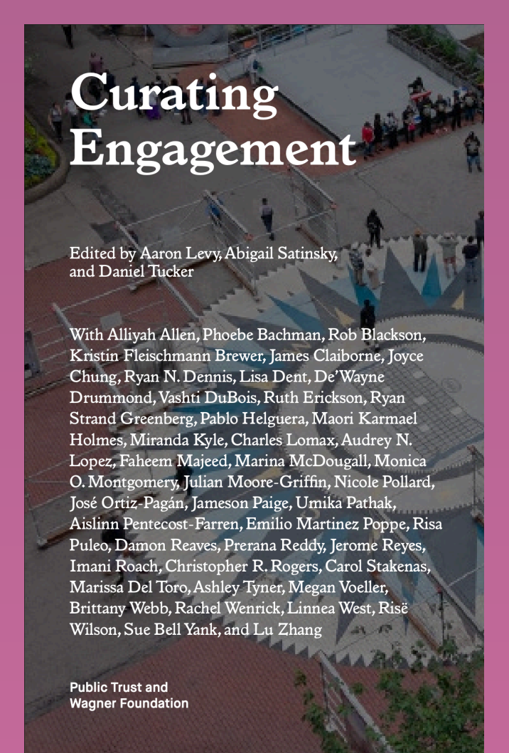
Cover of Curating Engagement