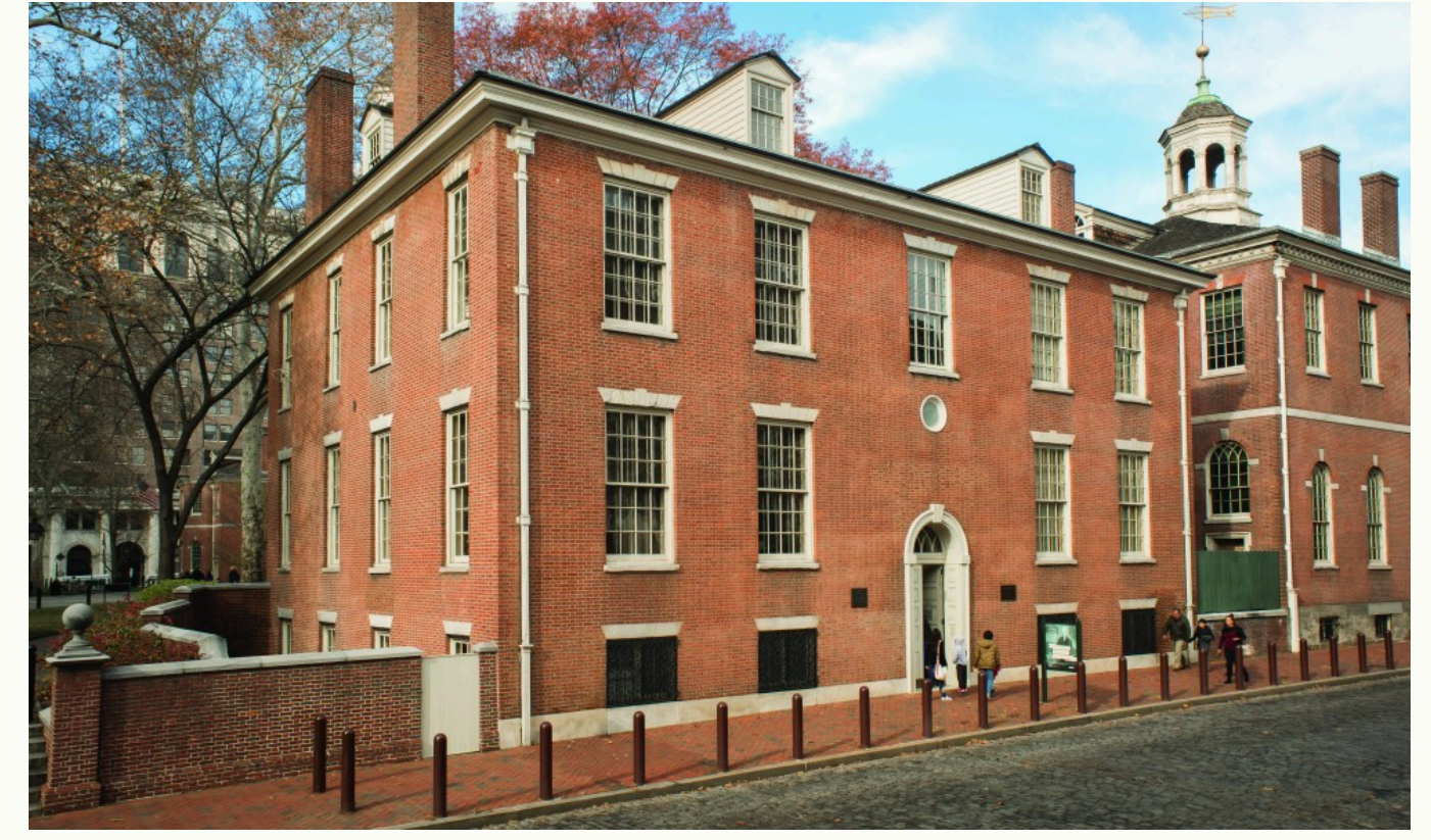
The original APS building, now called Philosophical Hall, from the outside.