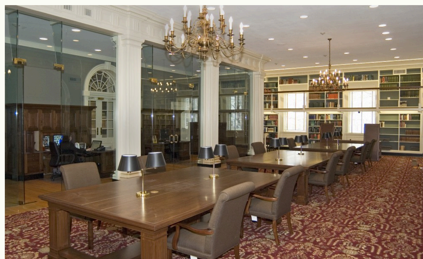
The reading room inside Library Hall.