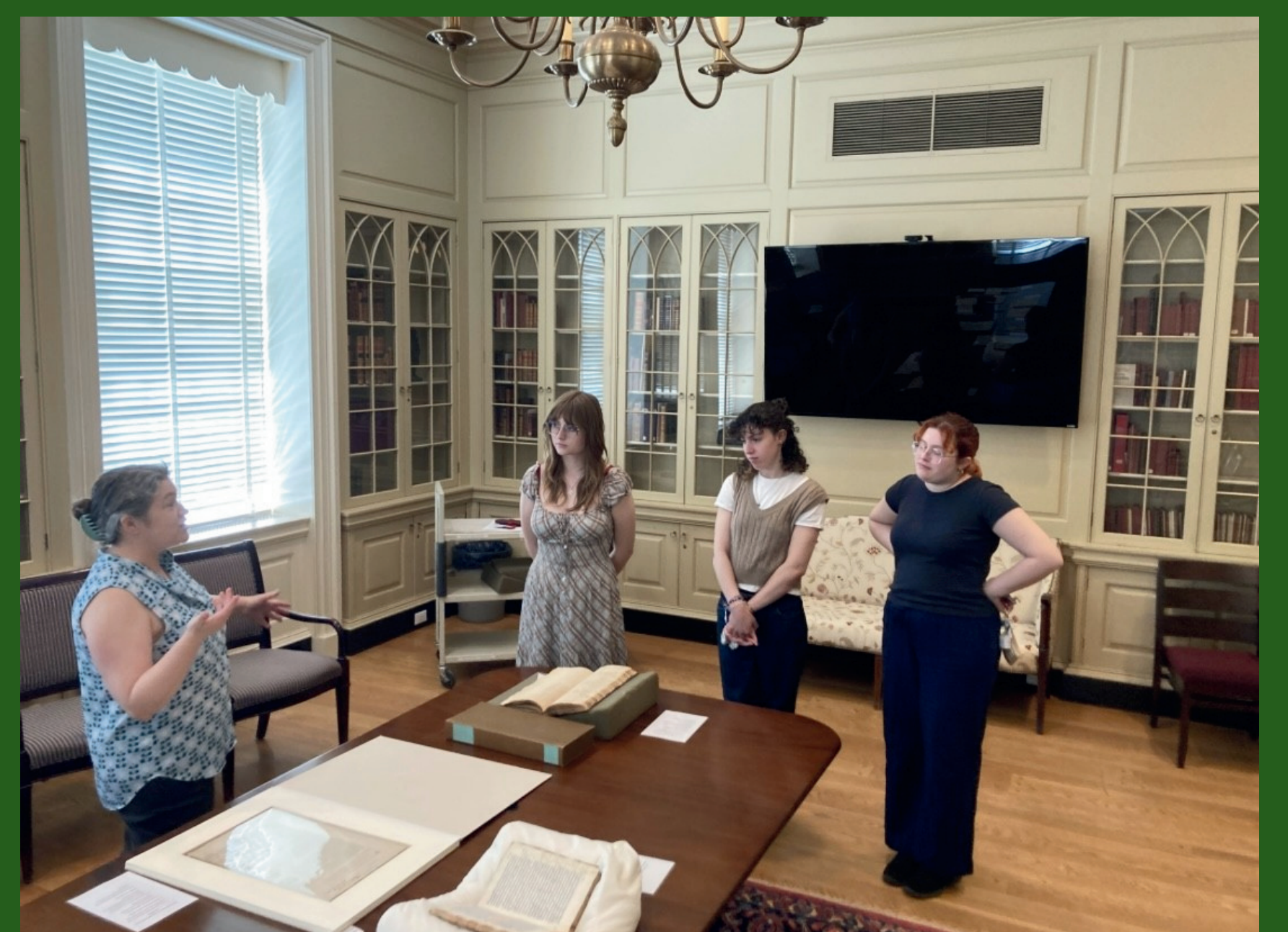
Our field trip to APS and the Museum of the American Revolution