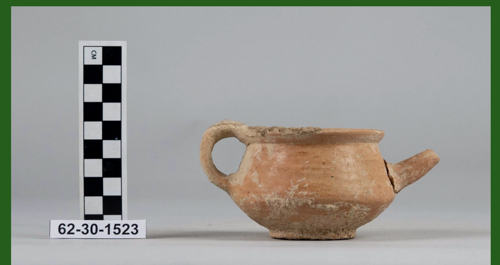
A spouted cup I photographed!